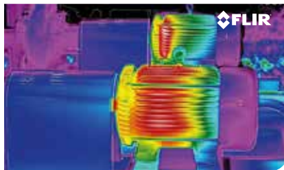
Continuous monitoring of a motor.