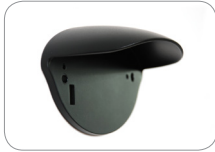
WC_HR50 Weather cover for the HR50 sensor